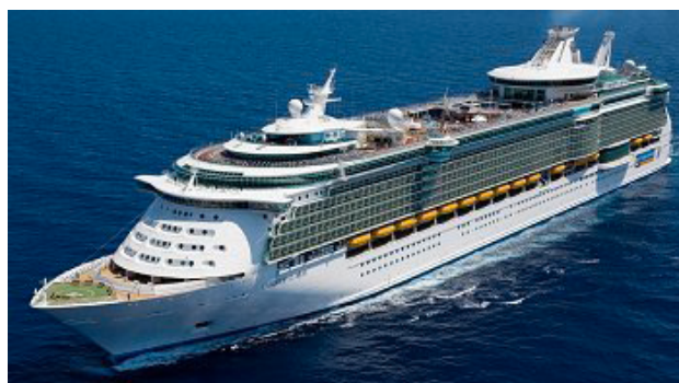
RCCL Independence of the Seas