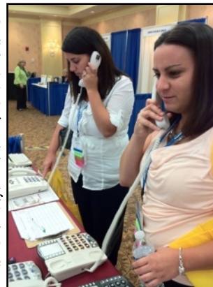
USF audiology students test the various FTRI telephones.

If your organization would like a presentation or distribution of the FTRI amplified telephones, please contact your nearest regional distribution center. Go to www.ftri.org and click on "Locations" on the left side of the page.